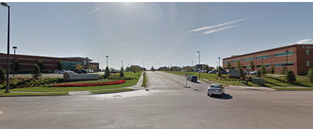
As you enter 175th Street from Burke Street, Building 110 is to your right.

Entrance E Physical Medicine and Rehabilitation Level one ENT, Allergy and Audiology Level two Facial Plastic and Reconstructive Surgery Level two Truhlsen Eye Institute and the Optical Shop Level two Olson Center for Women's Health Level two Internal Medicine Level two Rheumatology Level two Psychiatry Level two