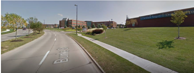
Note that you may only access this entrance driving east on Burke St.

Entrance A Aesthetic Surgery and Dreams MedSpa entrance Level one