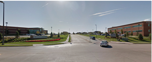
As you enter 175th Street from Burke Street, Building 111 is to your left.