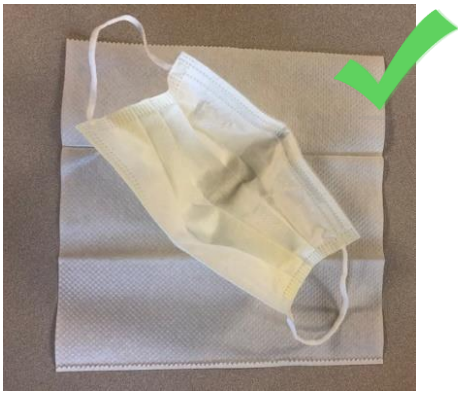
Figure 1 – These images on the left show the correct way to store mask when not in use. Notice the exterior of the mask is facing DOWN.

The following images are intended to provide clarification to avoid potential errors in the proper use and re-use of face masks.