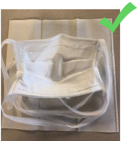
Figure 3 - This image shows the correct way to store a surgical mask when not in use. Notice the exterior of the mask is facing DOWN and ties are placed carefully away from the inside of the mask