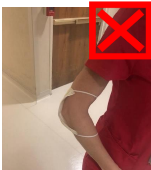
Figure 7 - This image demonstrates inappropriate use of procedure mask. Procedure mask should not be kept on the elbow when not in use