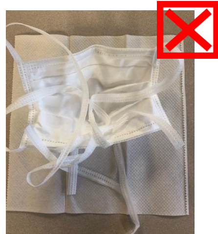
Figure 4 - This image demonstrates the wrong way to store surgical mask when not in use. Notice the exterior of the mask if facing up and ties are touching the interior of the mask. This is not correct