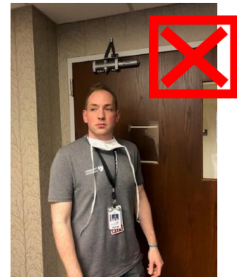
Figure 8 - This image demonstrates inappropriate wear of the surgical mask. Surgical mask should not hang from lower ties