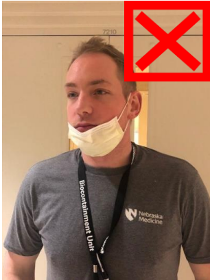
Figure 5 – This image demonstrates inappropriate wear of the procedure mask. Procedure mask should not be pulled under mouth