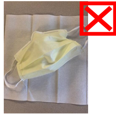
Figure 2 – These images on the right demonstrate the wrong way to place mask when not in use. Notice the exterior of the